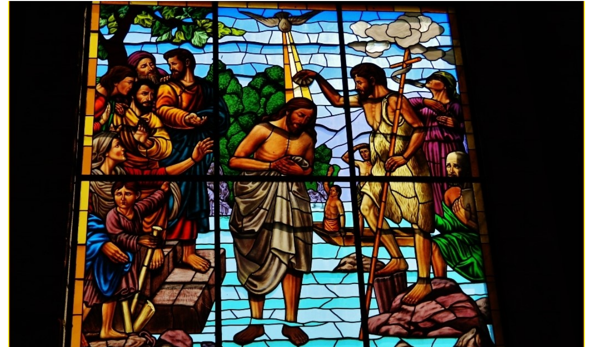
Image: Baptism of Christ , 20 th -century stained glass in Iguala, Mexico